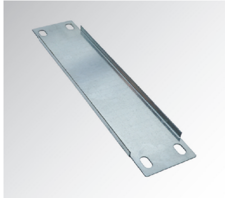
Standard Row Spacer

Standard Row Spacers are used to evenly space two rows of pallet storage racking that are adjacent to each other. The usable length of these lighter duty spacer components serve to support the minimal longitudinal flue space that is required in local fire codes.