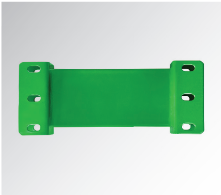
Heavy Duty Row Spacer

Heavy-Duty Spacers are lateral braces that attach horizontally between two column sections of aligned uprights allowing them to withstand greater seismic forces and provide increased storage weight capacities.