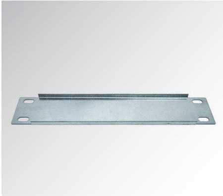
Standard Row Spacer